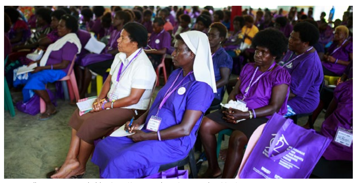
Bougainville WHRDs Forum held in Siwai (27 November - 01 December 2017).