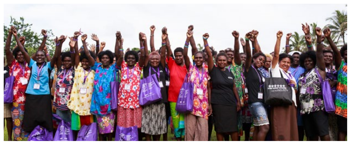
Women leaders at the Bougainville WHRDs Forum held in Siwai (27 November - 01 December 2017)

In Papua New Guinea, the National Strategy to Prevent and Respond to Gender Based Violence (2016-2025) recognises the role of Human Rights Defenders to champion behaviour change in their communities as a key component for reducing gender-based violence (Output 4.3).