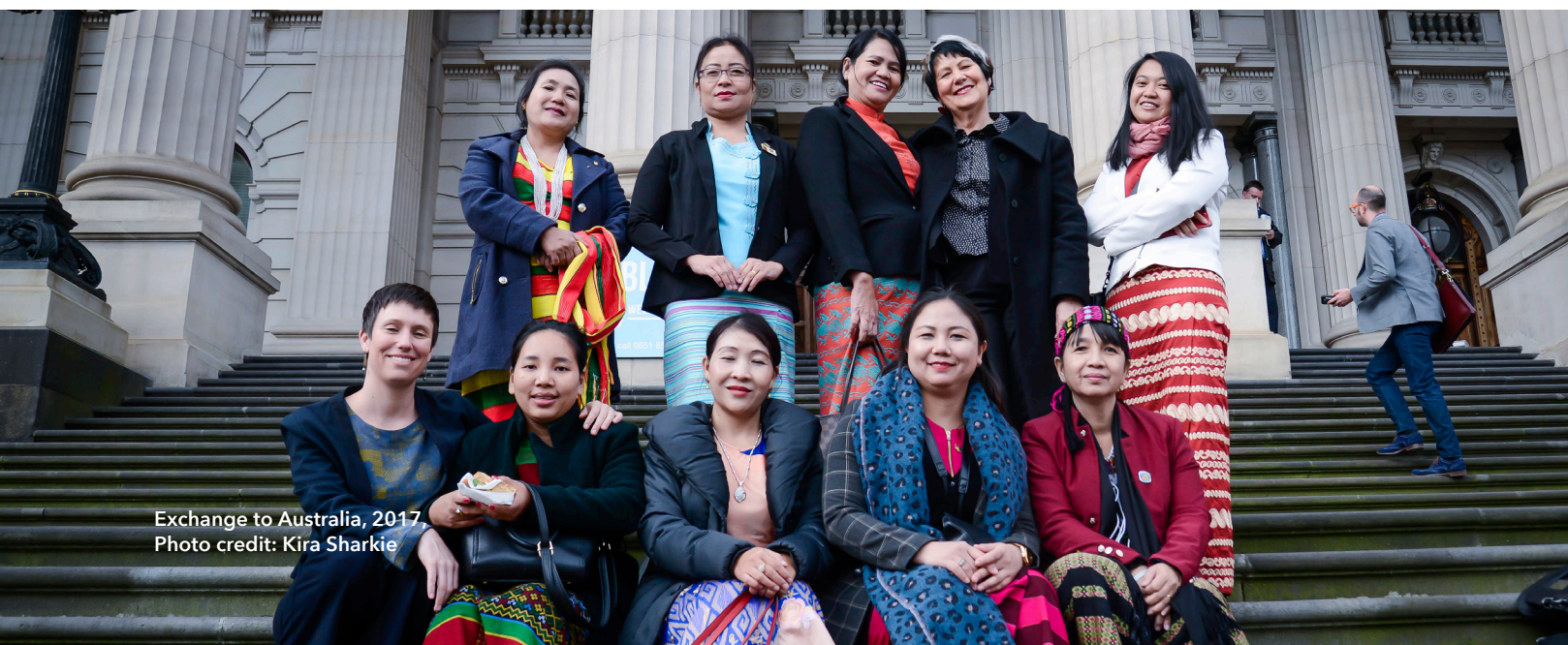
Exchange to Australia, 2017