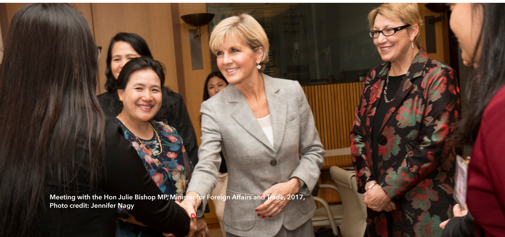
Meeting with the Hon Julie Bishop MP, Minister for Foreign Affairs and Trade, 2017, Photo credit: Jennifer Nagy

https://iwda.org.au/6-learnings-from-the-new-generation-of-myanmars-women-leaders-2/