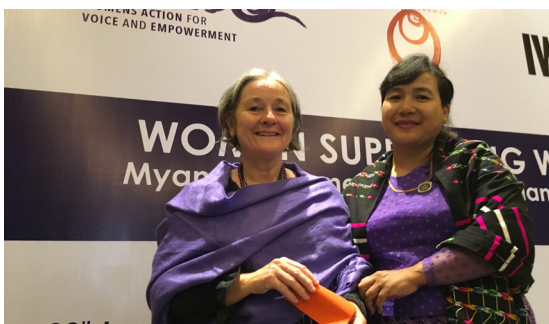
Senator Claire Moore and Daw Khin Swe Lwin MP, Photo credit: Shwe Wutt Hmon