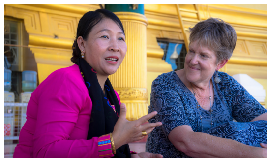
Daw Nan Htwe Htun MP and Former Senator Penny Wright