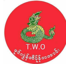
Ta'ang Women's Organisation