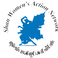
Shan Women's Action Network (SWAN)