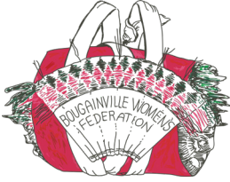
Bougainville Women's Federation (BWF)