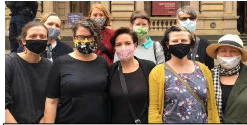
IWDA staff show support at 'Enough is Enough!' rally for Women's March 4 Justice, Melbourne, March 2021.

but an excellent relationship of solidarity.” 47 Key learning in this space pointed to the value of IWDA’s technical assistance - whether financial, project design or project implementation – but also highlighted opportunities to work towards our own redundancy and increase utilisation of locally-led expertise. Our stakeholders urged IWDA to “[k]eep maintaining and nurturing relationships the way they are now, which is not standard” 48 and in order to do this IWDA needs to be mindful about how IWDA staff engage with more experienced women leaders from the Global South, and how we manage, prioritise and budget for our accompaniment commitments.