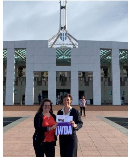
IWDA staff deliver Myanmar Statement to Australian Government Inquiry, 2021

IWDA also looked for opportunities to change the ways multilateral groups operated, for example via its work with the Generation Equality Action Coalition on feminist movements and leadership coordinated by UN Women, by both pushing for a feminist lens to inform the way the Action Coalition worked and by seeking opportunities for broader engagement with women leaders from the Asia Pacific region to influence the design of the Global Acceleration Plan to reflect priorities from this region.