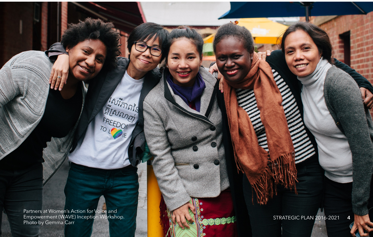
Partners at Women's Action for Voice and Empowerment (WAVE) Inception Workshop.